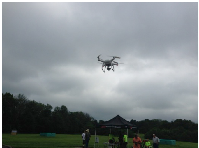
New tools for scouting deer and turkey. I wonder if this would be legal.