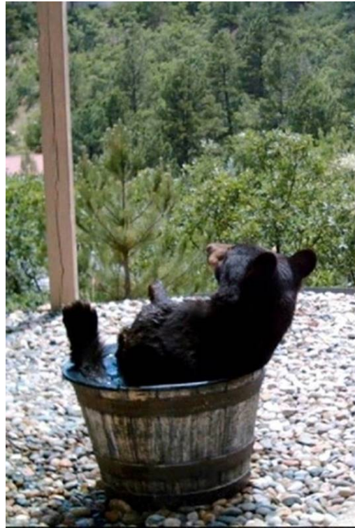
Everyone needs a pool in this heat!!