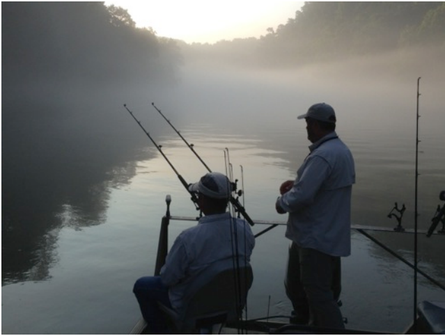
Looking for stripers on Cumberland River 90 degrees on land—72 degrees over 55 degree water—beat the heat!!