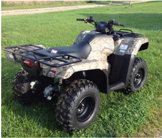
ATV purchased for Yellowbank