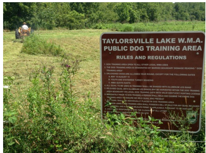
Preparing Dog Training Area