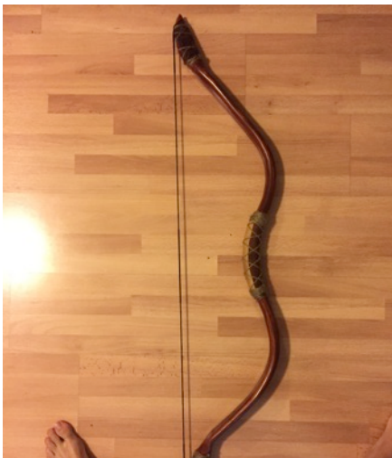
Bow made of PVC tube and twine. Formed with a heat gun 35 lb pull hits a 9" pie plate at 25 yards Made by a creative kid who does not hunt or shoot archery