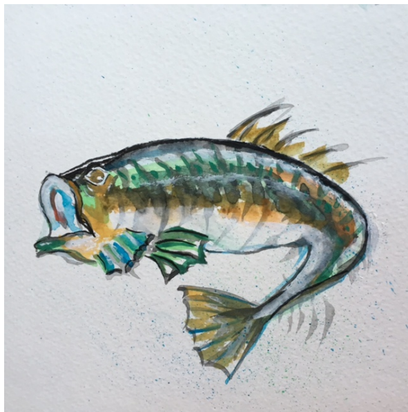
Just another month or so and these Guys will become very active