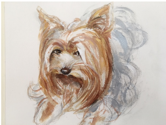
Keep this guy out of the cockleburrs