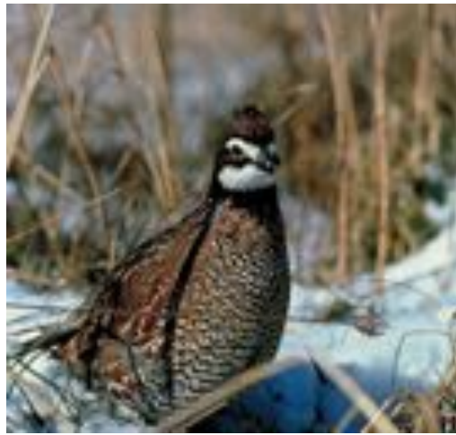
We need another mild winter like 2014-2015