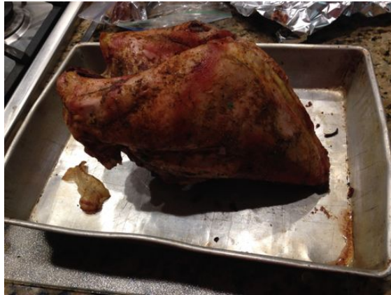
Chuck Juengling's smoked wild turkey-archery