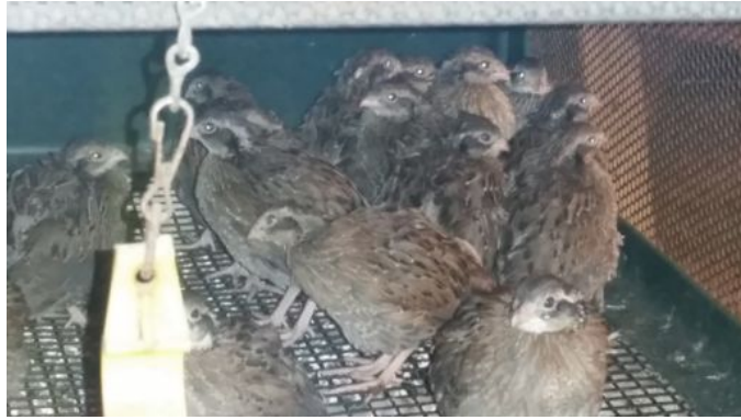
Quail Surrogation Project—High school project funded by the Kentuckiana Youth Chapter of Quail Forever gets an entire FFA program interested in Bobwhite quail-McCreary County