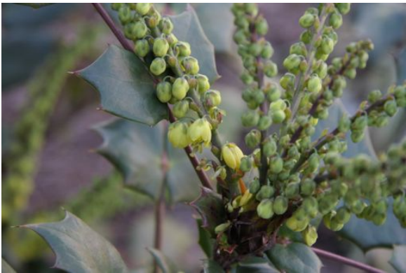
Flowers blooming on Xmas day 2015