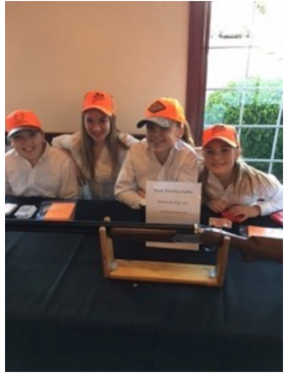
Our raffles sold out at the Banquet