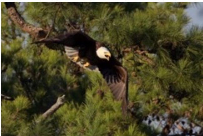
Our most spectacular bird guarding her nest