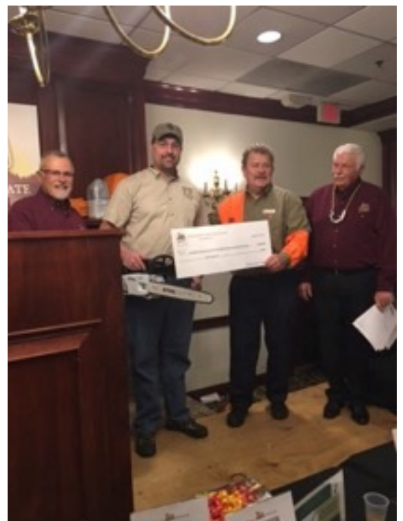
Presenting $5,000 to KDFWR for habitat project in eastern KY