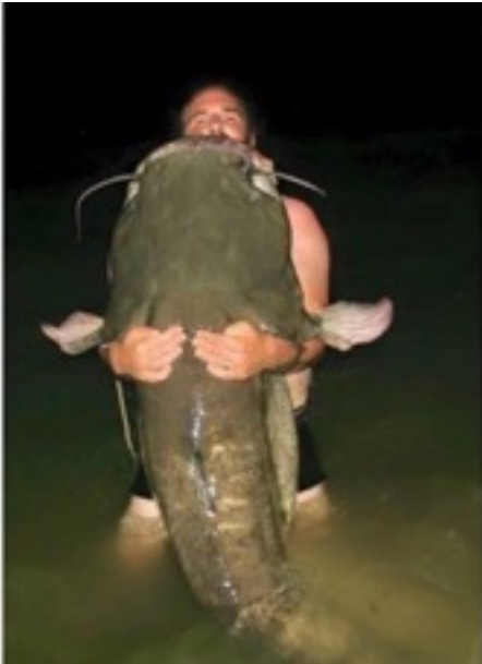
How to show love to a catfish